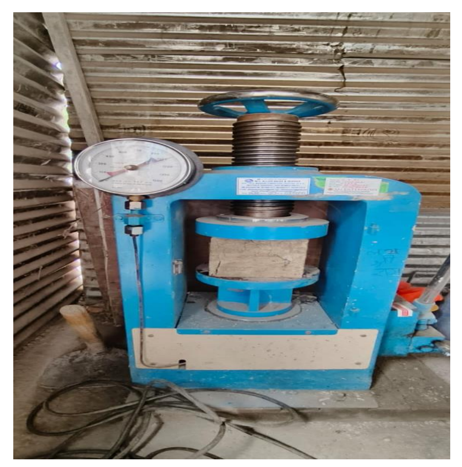
Fig 10 show of comparison of compressive strength